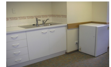
Board room Kitchenette